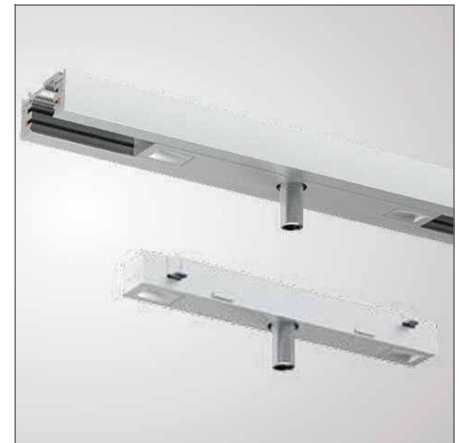
FLUSH MOUNT ADAPTOR