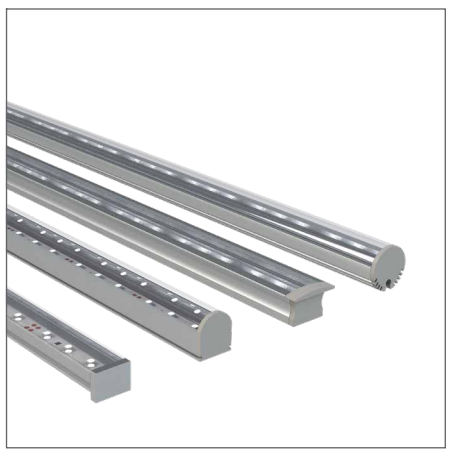
MUST BE USED WITHIN A HEATSINK