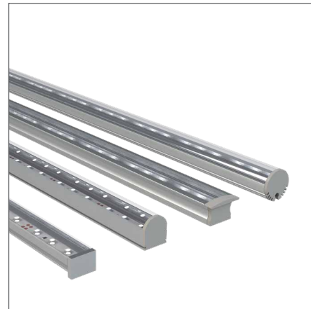
MUST BE USED WITHIN A HEATSINK

* Choose from our full range of LED Tapes & Boards online.