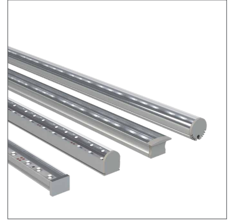
MUST BE USED WITHIN A HEATSINK